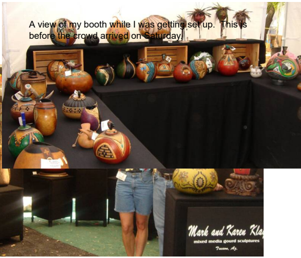
A view of my booth while I was getting set up. This is before the crowd arrived on Saturday!