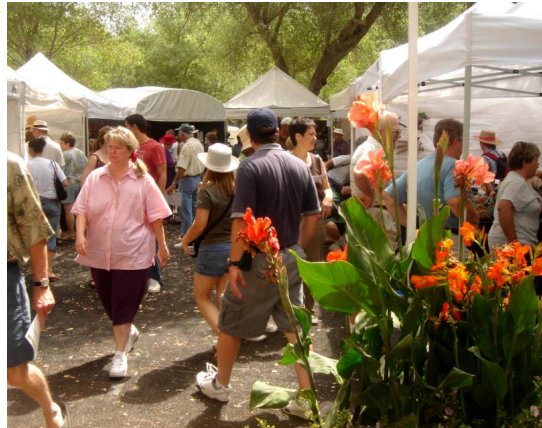
Festival attendees enjoying the art.